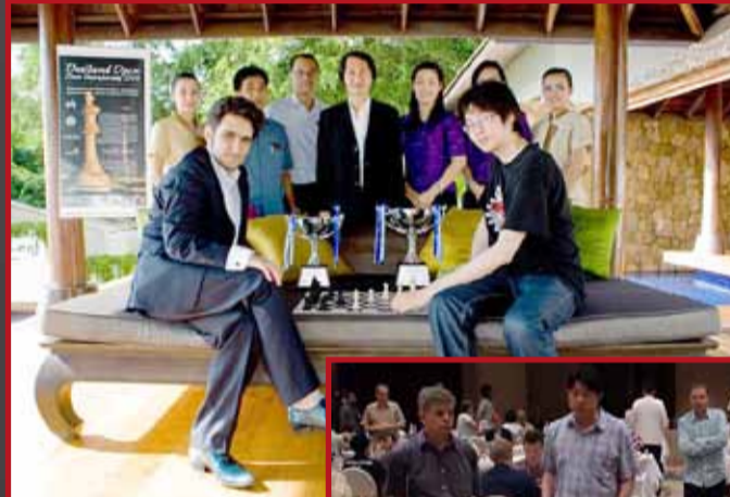
Winners and officials at our previous tournament in Pattaya